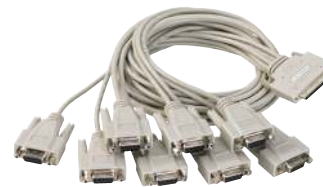
RocketPort EXPRESS SMPTE Octacable