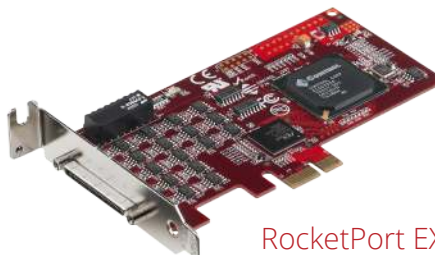
RocketPort EXPRESS SMPTE Card