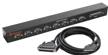
RocketPort EXPRESS 8-Port SMPTE Rackmount Interface