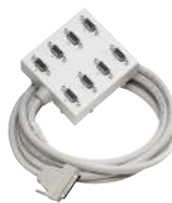
RocketPort EXPRESS 8-Port SMPTE Interface